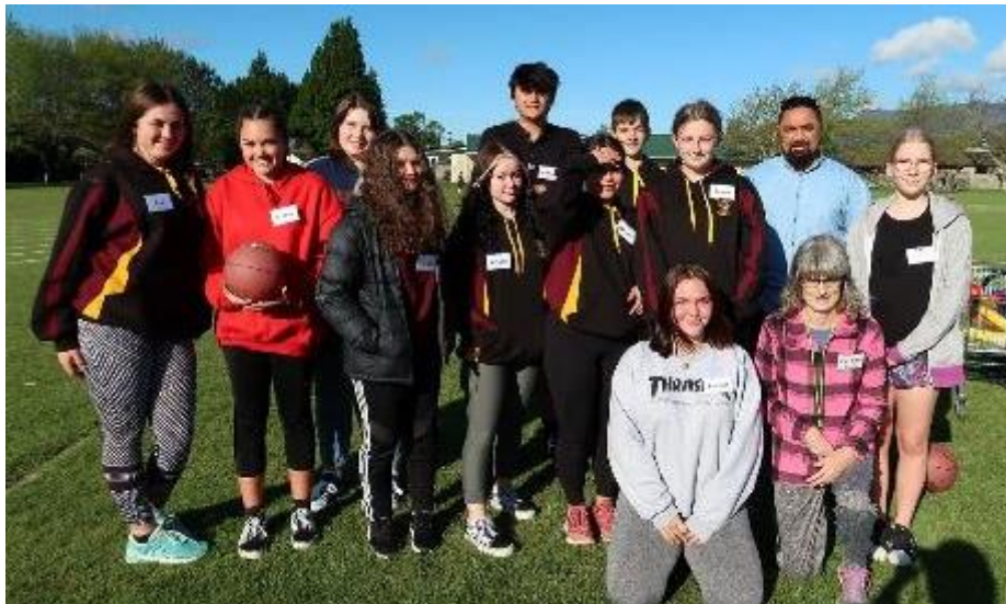
GSG Volunteers for Upper Hutt Athletics Club