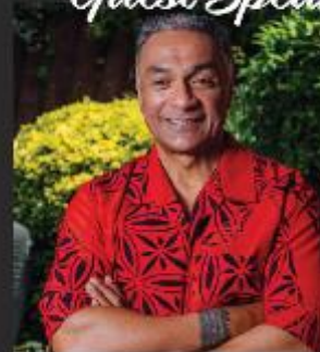
ETE UATI ETE The Laughing Samoan