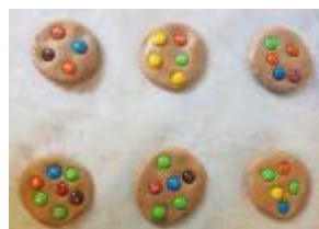
Madi’s Hot Chocolate M&M Cookies