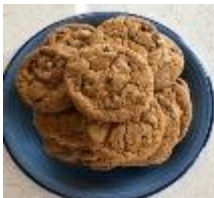
Grace’s Chewy Chocolate Chip Cookies