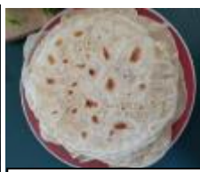
Aston's Tortilla Bread