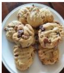
Olivia’s Choc Nut Extravaganza