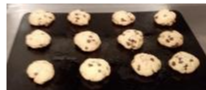
Max’s Choco Nut Biscuits