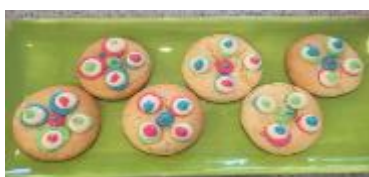
Kendyll’s Little Monsters Biscuits