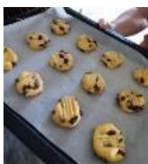
Justin’s Rum & Raisin Biscuits