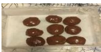
Aaron’s Chocolate Biscuits