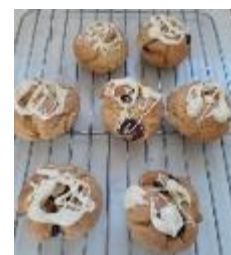
Ethan’s Chocolate Chippie Biscuits