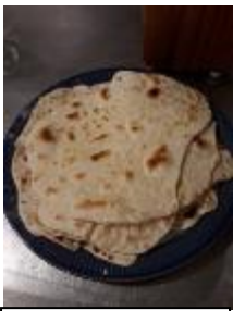
Zoe's Tortilla Bread