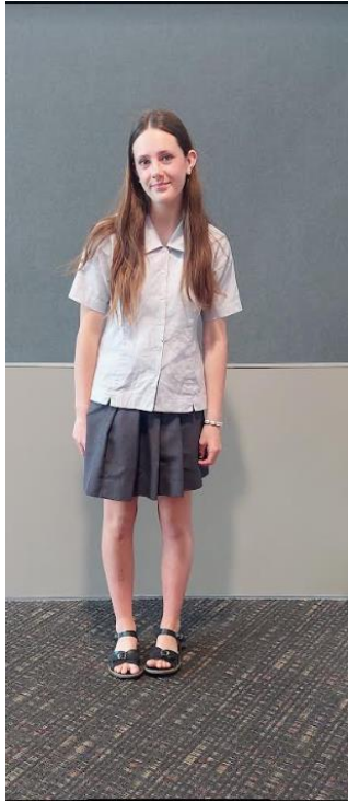
School skirt, junior shirt Black Roman Sandals