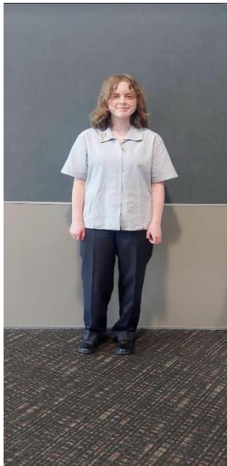
School trousers Junior shirt Plain black shoes