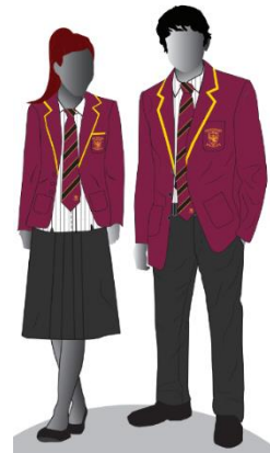
Executive Leader blazer – worn with shirt and tie Vest or jersey only (no hoodie)