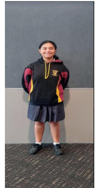
School hoodie, school skirt, plain white socks, Plain black shoes