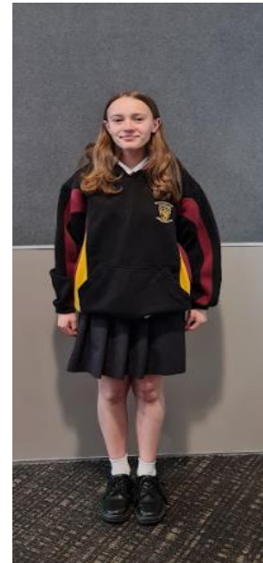
School hoodie, skirt Plain white socks Plain black shoes