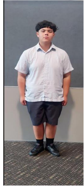
School shorts, Junior shirt, Plain black socks, Plain black shoes