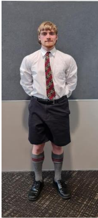
Senior unfitted, long sleeve shirt and tie School shorts, grey socks, Plain black shoes