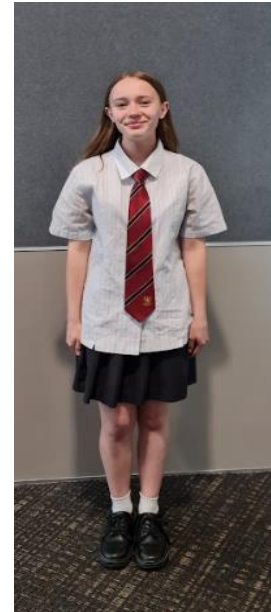
Senior fitted shirt and tie, grey skirt Plain white socks Plain black shoes