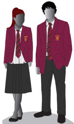
Senior blazer – to be worn with shirt and tie Vest or jersey only (no hoodie)