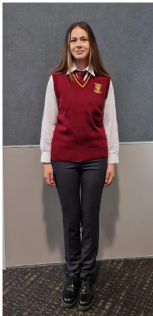
Senior vest, shirt and tie Plain black shoes