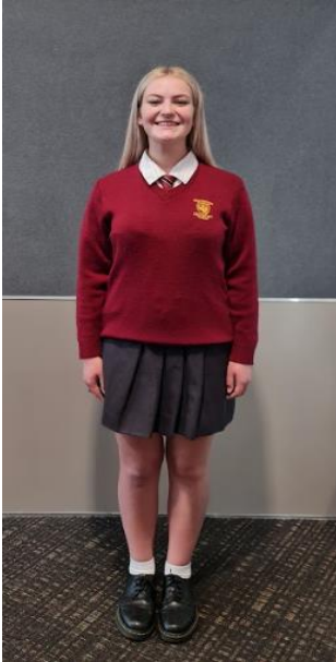
School jersey and skirt Senior shirt and tie Plain black shoes, plain white socks