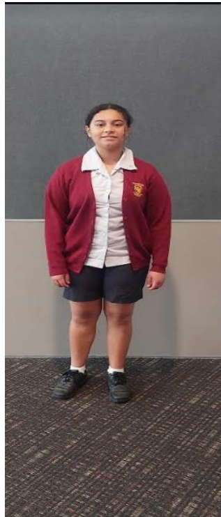
School shorts and cardigan Junior shirt, plain white socks, plain black shoes