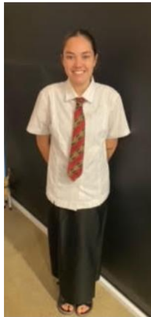
Senior shirt and tie Plain black Lavalava, plain black Roman Sandals