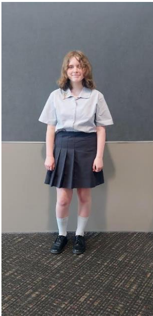
School skirt, Junior shirt, Plain white socks, Plain black shoes