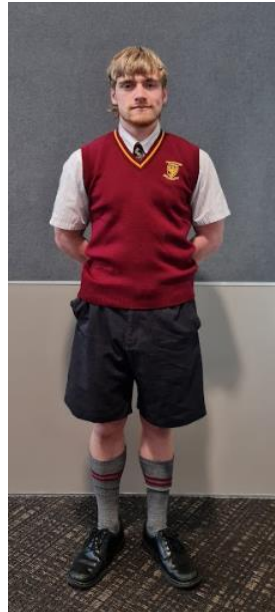
Senior vest, shorts Senior shirt and tie Plain black shoes